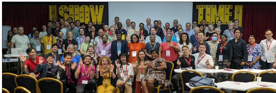
Delegates take a few minutes for a photo opportunity at the International Humanist Conference in Singapore